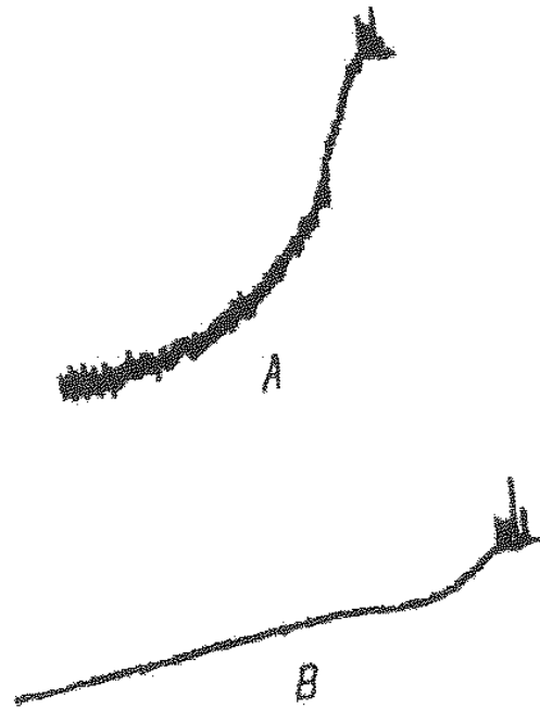
Fig. 2. ADP-induced platelet aggregation in vitro and the influence of 10% solution of Cernitin T60 [B], as compared with control [A].